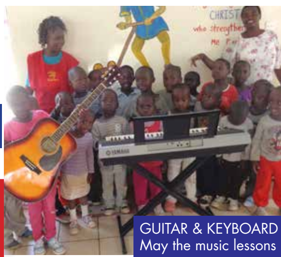
GUITAR & KEYBOARD May the music lessons begin!

Every good and perfect gift is from above, coming down from the Father of the heavenly lights, who does not change like shifting shadows. James 1:17