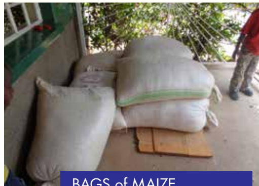
BAGS of MAIZE All because you gave!

In just a month and a half YOU - our CWH Supporters - raised $15,419 through the Christmas Book of Wishes! Words cannot describe our appreciation for you and your giving hearts! We are so excited to see how God will use each gift provided throughout the next year. To the CWH-Tobiah Home children you gave nutrition, support for education and music education, fun toys for development, household items, truck tires, supplies for maintenance and building projects, and child sponsorship. WOW - so amazing and we thank God for each of you!